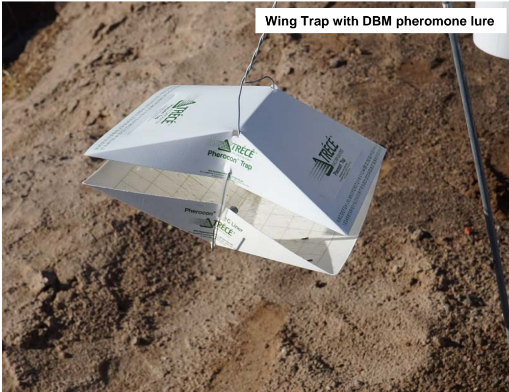
Wing Trap with DBM pheromone lure